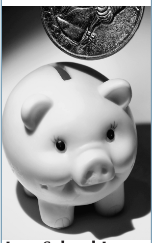
Law School Loans

Visit us on the Web www.LawschoolLoans.com